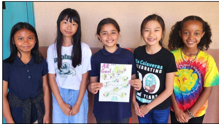
AR Board winners