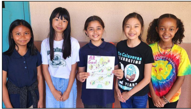
AR Board winners