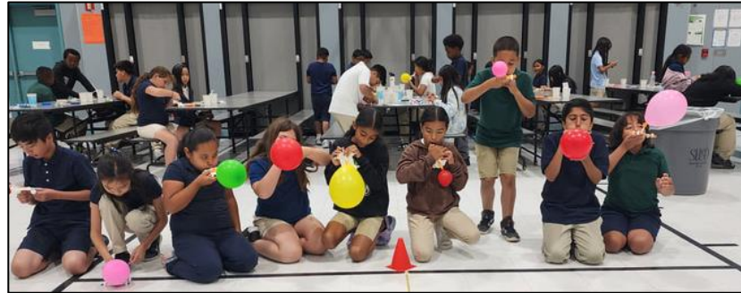
Balloon cars STEAM project