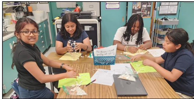
Building Marshmallow Towers